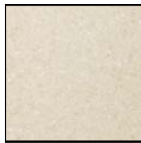
Pebble Saratoga Minimum 3%