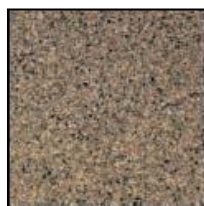
Quarry Mesa Minimum 3%