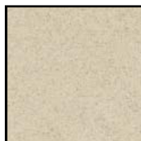
Sanded Gold Dust Minimum 3%