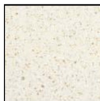
Quarry Oyster Minimum 3%