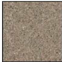
Aspen Brown Minimum 3%