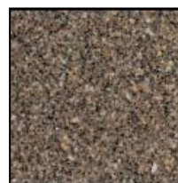
Quarry Bluff Minimum 3%

This Technical Bulletin is intended to provide guidelines for optimal fabrication, installation, and performance of Samsung products mentioned. Though the information contained herein is deemed reliable, none of the contents--including but not limited to the instructions, techniques, graphics, and recommendations--is to be understood as implying legal liability of fitness for a specific purpose, any other type of warranty, or being complete or absolute in its range and nature of information.