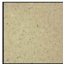
Pebble Seastar Minimum 3%