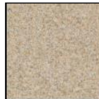
Sanded Vermillion Minimum 3%