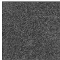
Sanded Dark Nebula Minimum 3%