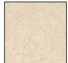
Sanded Sahara Minimum 3%