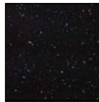
Pebble Sienna Minimum 3%