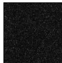
Sanded Onyx Minimum 3%

This Technical Bulletin is intended to provide guidelines for optimal fabrication, installation, and performance of Samsung products mentioned. Though the information contained herein is deemed reliable, none of the contents--including but not limited to the instructions, techniques, graphics, and recommendations--is to be understood as implying legal liability of fitness for a specific purpose, any other type of warranty, or being complete or absolute in its range and nature of information.