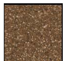
Pebble Copper Minimum 3%