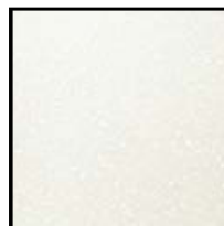
Pebble Frost Minimum 3%