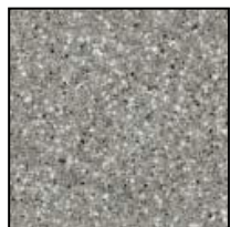
Pebble Grey Minimum 3%