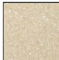
Pebble Gold Minimum 3%