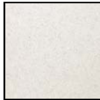
Aspen Snow Minimum 3%