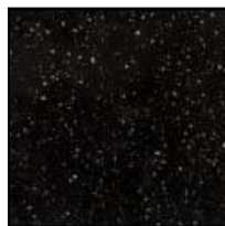
Pebble Ebony Minimum 3%