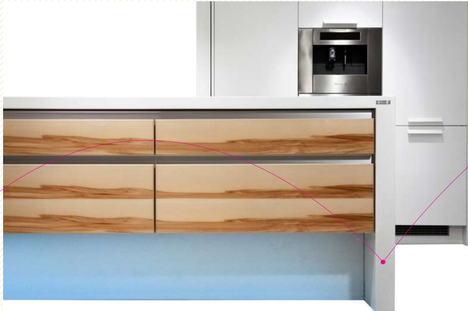
Kusshand in Korea