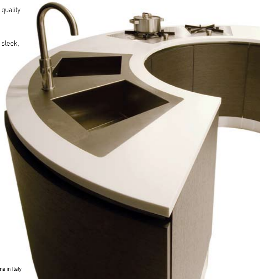
Euro Cucina in Italy

In addition, a variety of curves can be added for a sleek, unique design that meets your needs.