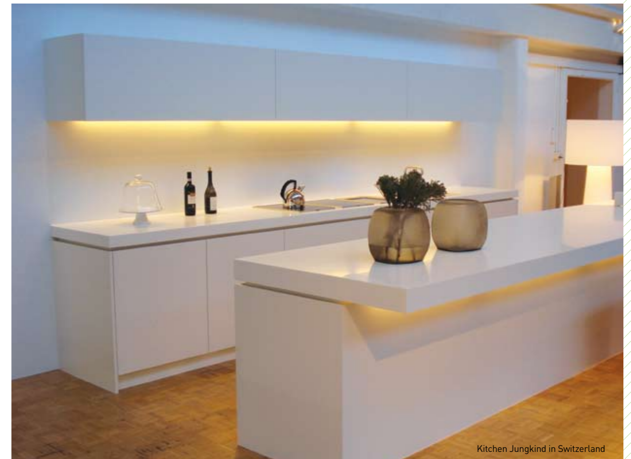
Kitchen Jungkind in Switzerland