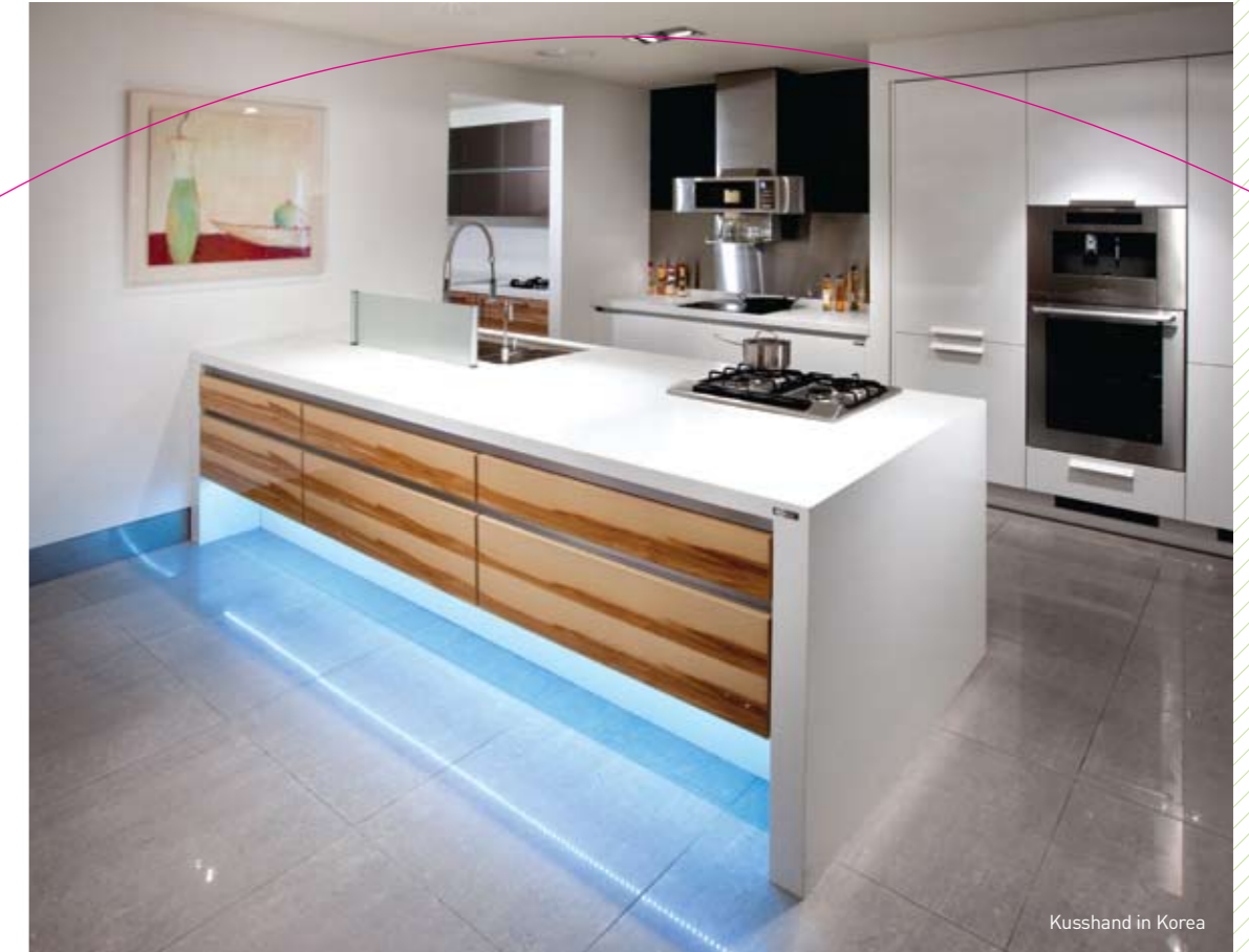
Kusshand in Korea