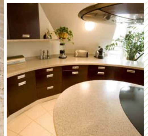
Euro Cucina in Italy