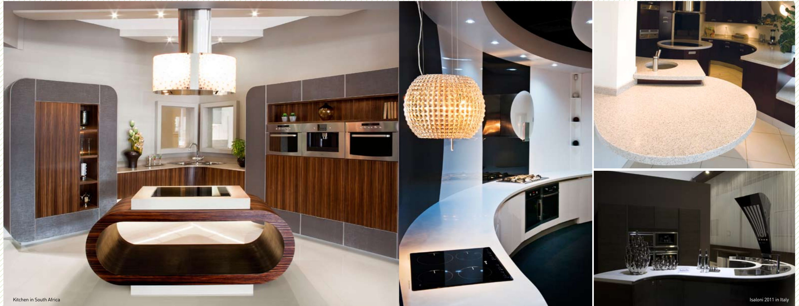
Kitchen in South Africa