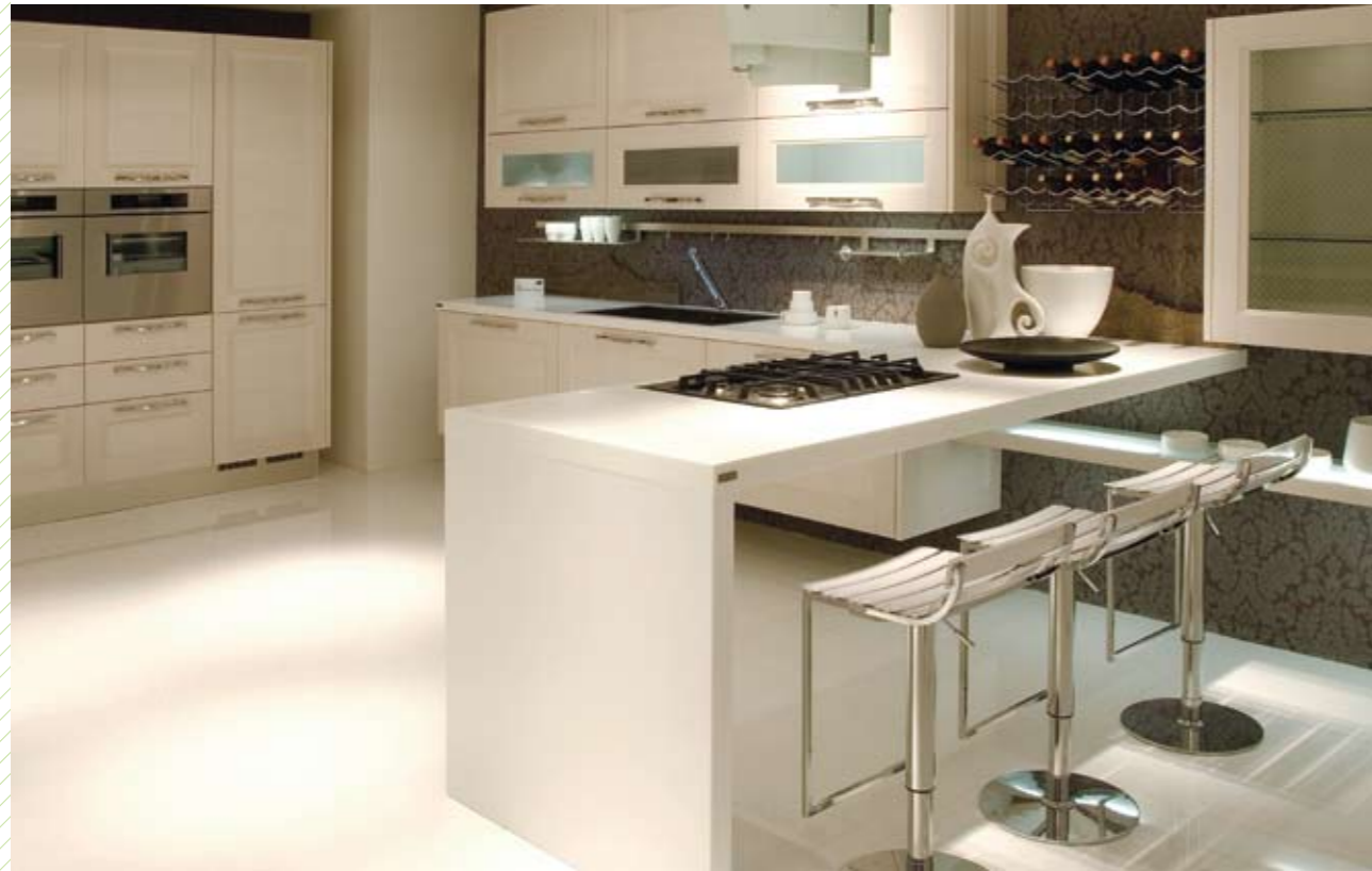
Euro Cucina in Italy