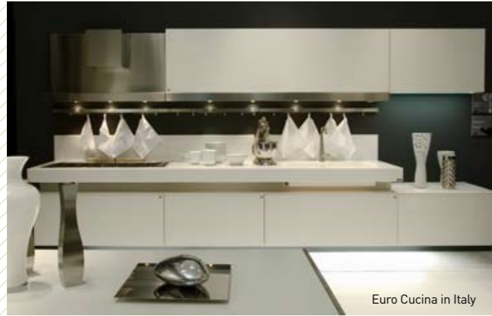
Euro Cucina in Italy