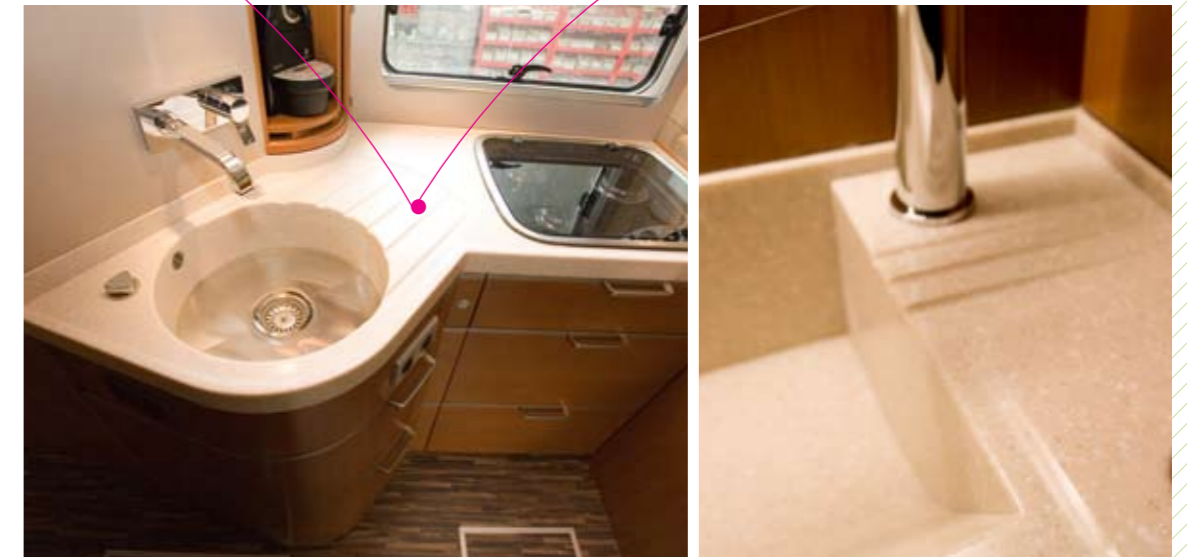
Camping Car in Germany