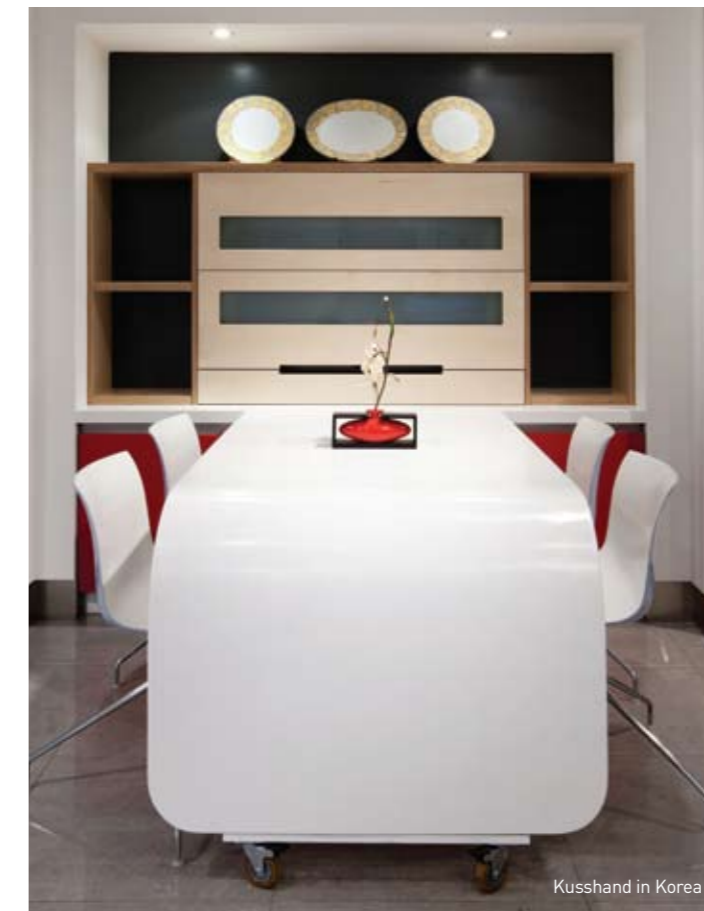
Kusshand in Korea