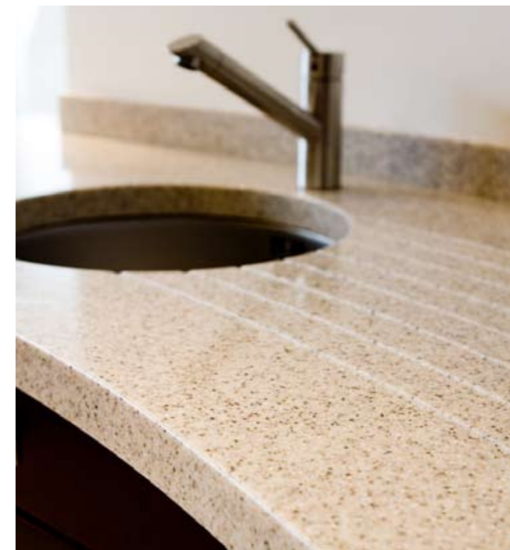
Euro Cucina in Italy