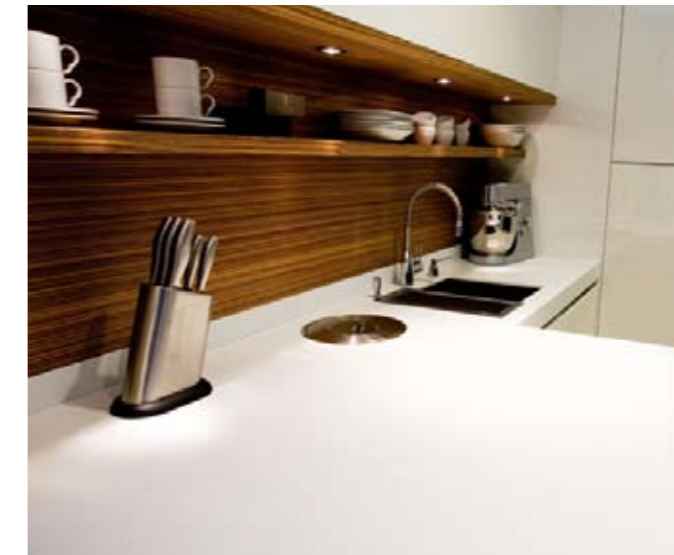
Kitchen Showroom in meil in France