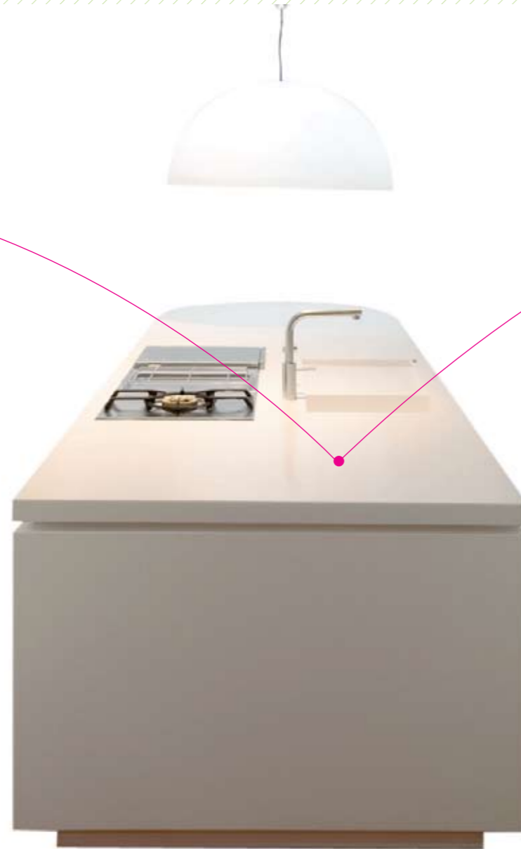
Isaloni 2011 in Italy