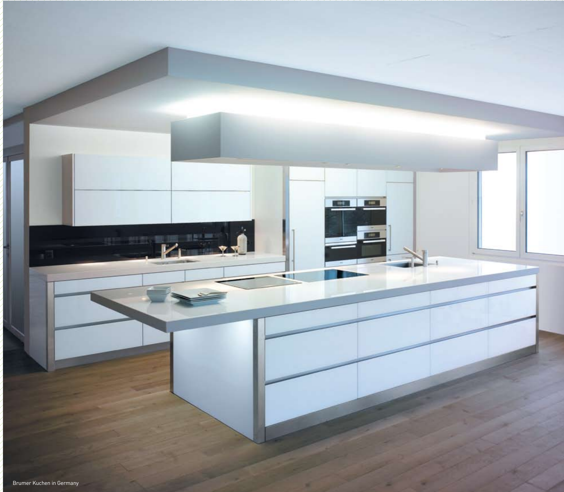
Brumer Kuchen in Germany

For you and your loved ones, we bring special joy to the kitchen area.