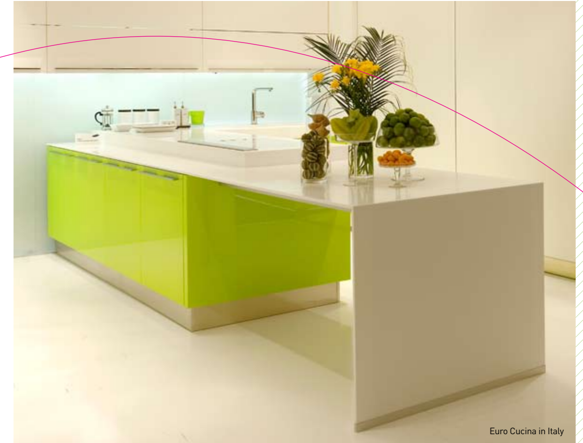
Euro Cucina in Italy

Due to its durability, it is easy to restore in the event there is a crack or damage to material. While cooking in the kitchen, you have probably damaged the tops of your counters with knives and cookware. Staron solid surface can be easily restored to make your kitchen new again.