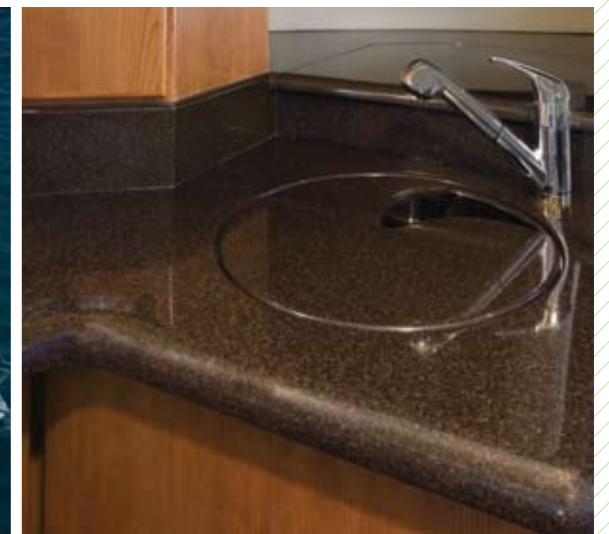
Ovation Yacht in U.S.A